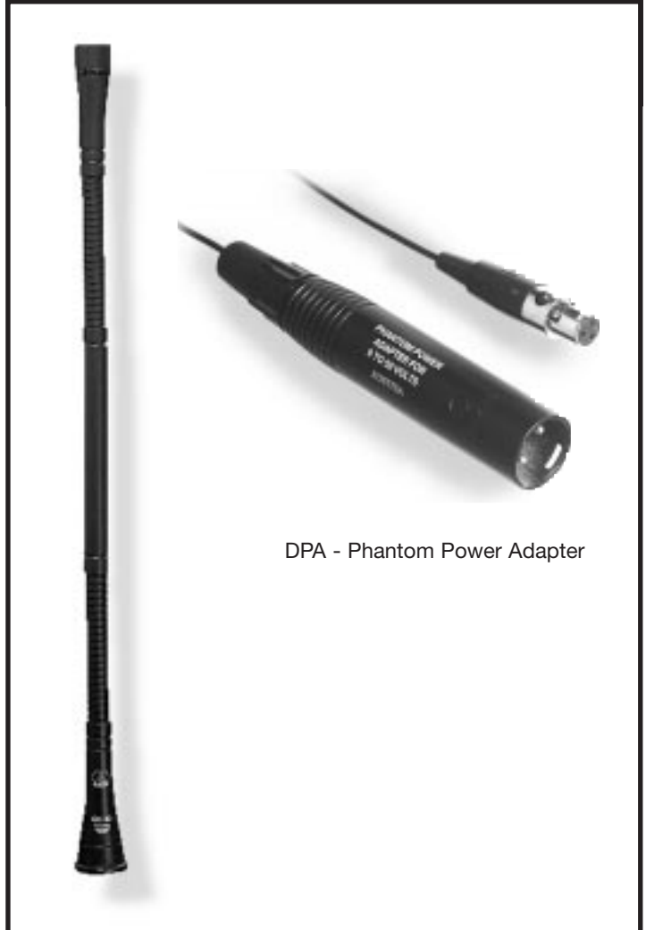
DPA - Phantom Power Adapter